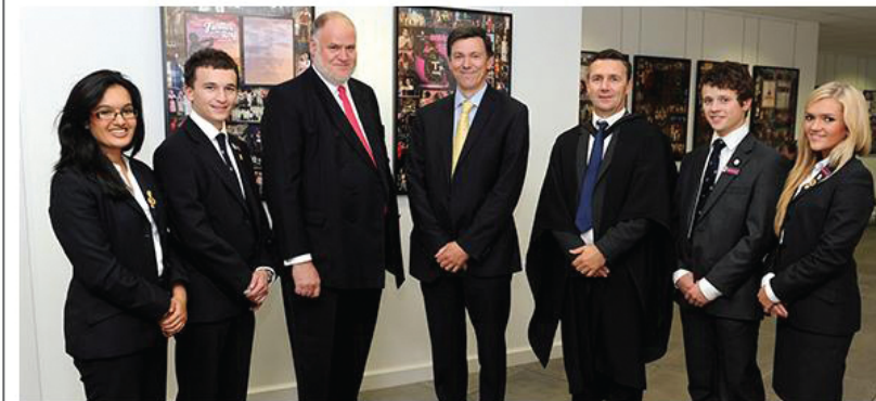
Professor Presents The Prizes At Solihull School