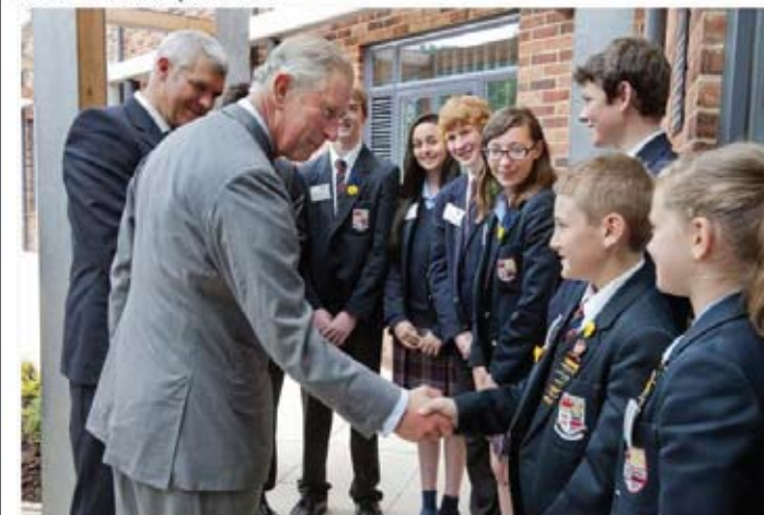
Prince Charles, Prince of Wales Opens The Marie Curie Hospice in Solihull

Boys and girls from Solihull School enjoyed a date with Royalty when they were invited to the official opening of the new Marie Curie Hospice in Solihull.