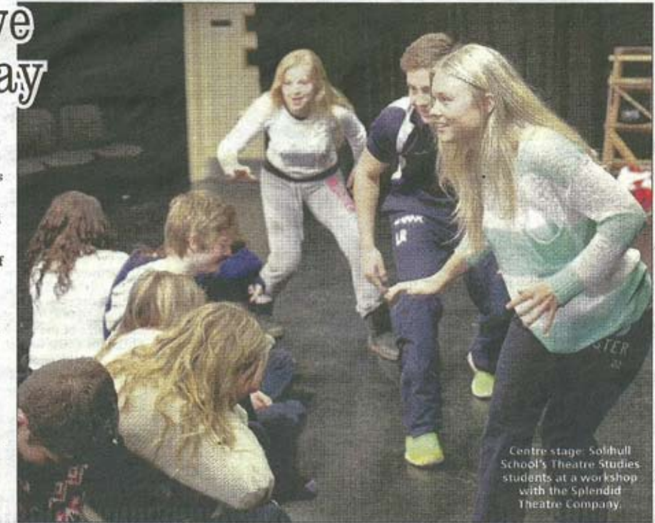
Centre stage: Solihull School's Theatre Studies students at a workshop with the Splendid Theatre Company.

"They thrived on the challenges and came away not only with greater knowledge but also with greater confidence in their abilities."