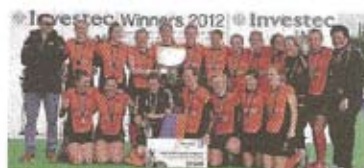
Hockey champions Leicester Ladies.

Members of the team will hold a question and answer session after an extended period of tuition with competitions