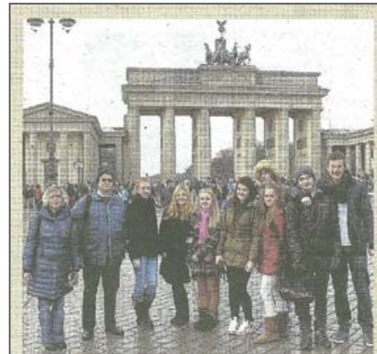
GERMAN VISIT: The Solihull School students at the Brandenburg Gate.