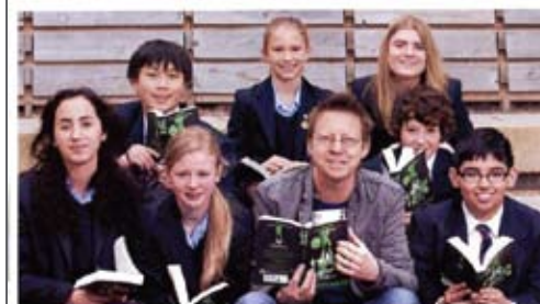
Radio presenter and children's author Simon Mayo with Solihull School pupils.