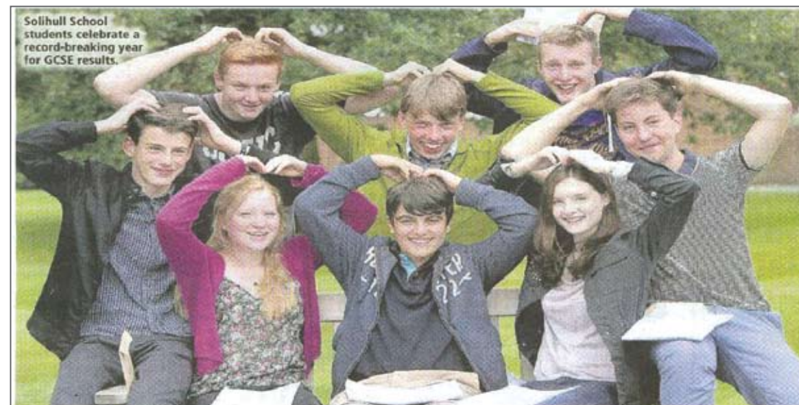
Solihull School students celebrate a record-breaking year for GCSE results.

Record-busting grades at A* to A in GCSE exams were matched by record-equalling results at the same grades in A-Levels, ranking Solihull firmly among the UK's top 100 independent schools according to The Daily Telegraph.