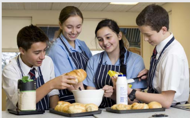
Lower School pupils celebrating National Baking Day.