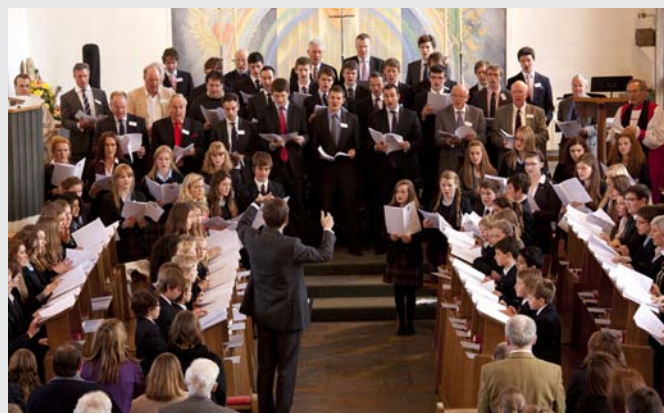
This term saw the inaugural meeting of the Solihull School Former Choristers' Association. See inside for details.