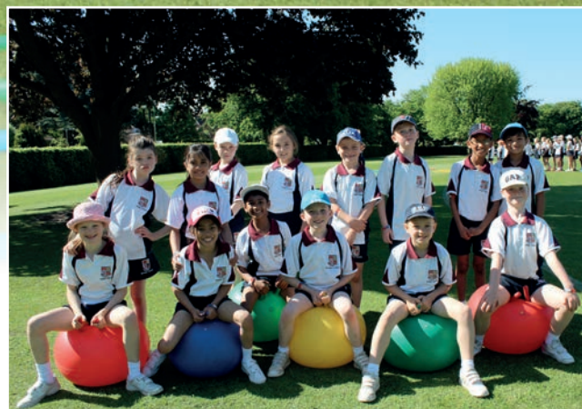
The Croft and KHPS with their excellent fielding skills. Also, our U9 team had a nail-biting match against Eversfield, narrowly losing 15 ½- 15.