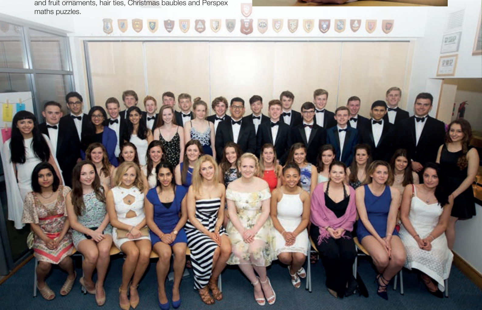
This year's Bench enjoyed the annual summer soiree in the Alan Lee Pavilion.